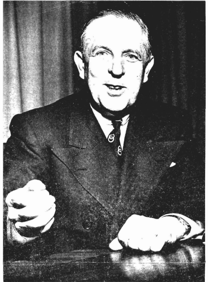
Paul Gray Hoffman Administrator of the Marshall Plan

Attracting the attention of Dag Hammarskjold, Secretary-General of the United Nations, Hoffman was appointed Managing Director of the United Nations Special Fund (later to be called the U.N. Development Program), which was created to help countries that wanted outside financing to develop natural resources. Under his supervision (from 1959 to his retirement at the age of 80 in 1972), the U.N. Development Program (and its predecessor, the U.N.