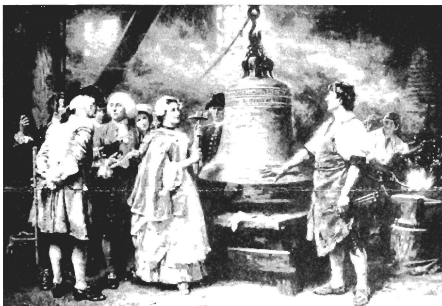
The Bell's First Note by J. L. Ferris